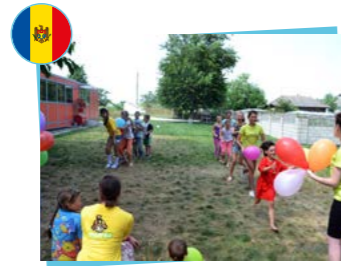
Concordia Football Association of Moldova