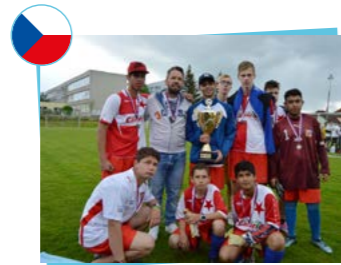
Sportovní Football Association of the Czech Republic