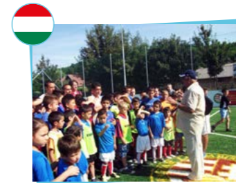
Janos Farkas Foundation Hungarian Football Federation