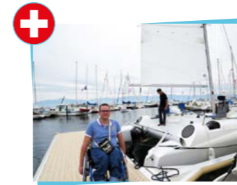
Just for Smiles Swiss Football Association