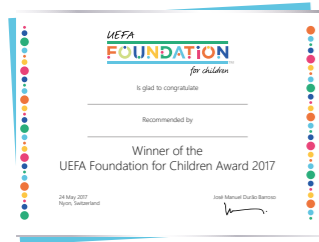
Winner: Nominated by:

Eligible projects were nominated by 23 member associations. With three of those associations having already received financial support from the foundation in the past, the board of trustees decided to share the €1m prize money equally between the 20 remaining associations (€50,000 each).