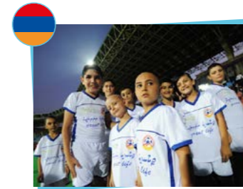
Grant Life Football Federation of Armenia