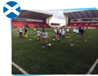
Scottish Football Partnership Trust Scottish Football Association