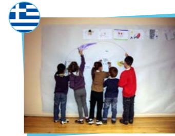
Mazi gia to Paidi Hellenic Football Federation