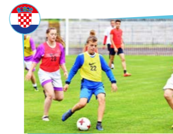
World Roma Organization Croatian Football Federation