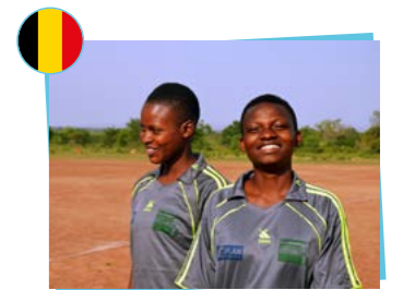
Plan Belgique Royal Belgian Football Association