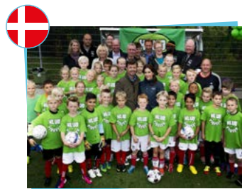
Mary Foundation Danish Football Association