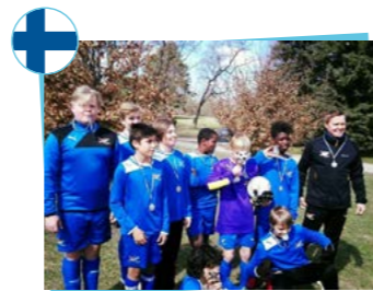
Icehearts of Finland Football Association of Finland