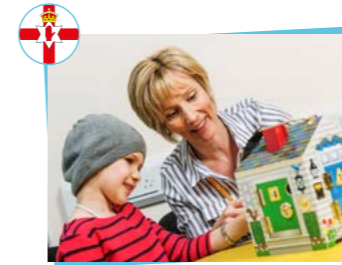
Cancer Fund for Children Irish Football Association