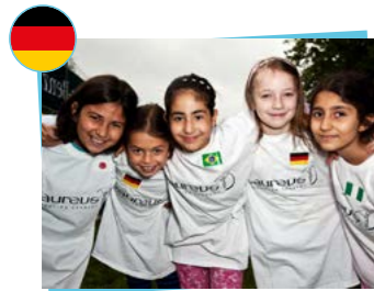
Integration durch Sport und Bildung e.V. German Football Association