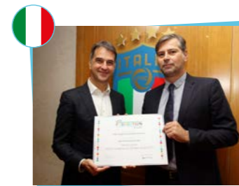
Crazy For Football Italian Football Federation