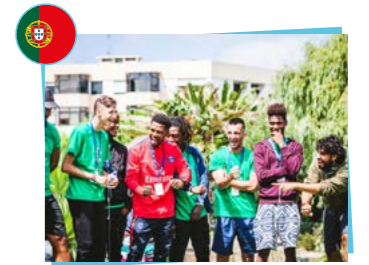
CAIS – Associação de Solidariedade Social Portuguese Football Federation