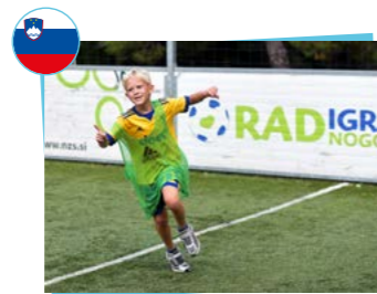
Youth health and Summer resort Debeli Rtic Football Association of Slovenia