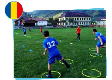
Policy Center for Roma and Minorities Romanian Football Federation