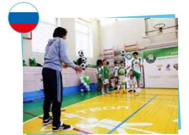
Football for Kids Football Union of Russia