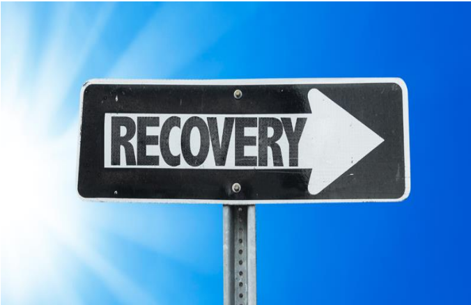
2020 to now