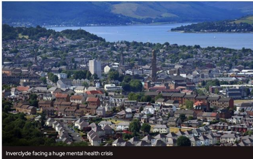
Inverclyde facing a huge mental health crisis